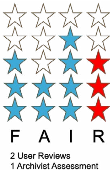
Figure 1. Example of a FAIR badge designed for FAIRdat