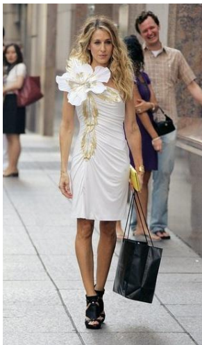
FIGURE 1: CARRIE OUTFIT 1