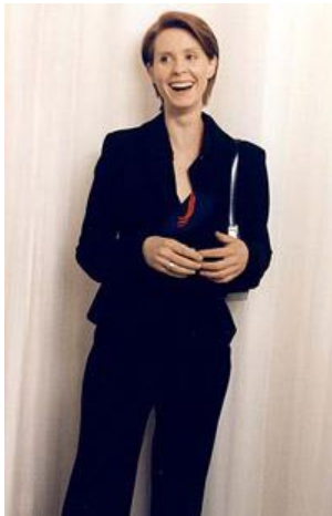
FIGURE 4: MIRANDA OUTFIT 1