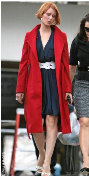
FIGURE 5: MIRANDA OUTFIT 2

Miranda has a very classic dress style and wears rather dark colours. Her outfits are stylish and smart and underline her professionalism. Both are outfits are practical, but still chic.