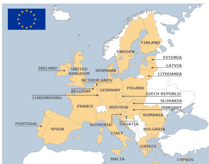
Image 1. Member states of the EU 223

According to the demographics of 1 January 2014, the population of the European Union is 507,416,607 people. 222 Chronologically speaking, the European Union has formed of six founding states (the inner six) in 1952, France, Italy, West Germany, Belgium, Luxembourg, and the Netherlands. In 1973 the United Kingdom, Denmark and Ireland joined the Union. Later in 1981 Greece joined. 5 years later in 1986, Spain and its neighbour Poland joined the EU. Sweden, Finland and Austria were added to the Union in 1995. After 9 years in 2004, the biggest enlargement took place with the memberships of Estonia, Latvia, Lithuania, Poland, Czech Republic, Slovakia, Hungary, Slovenia, Cyprus and Malta. In 2007 Romania and Bulgaria joined the Union too and finally in 2013 Croatia became a member of the EU. There are six candidate countries for the membership of the EU today, which are Iceland, Montenegro, Albania, Serbia, Turkey and Macedonia.