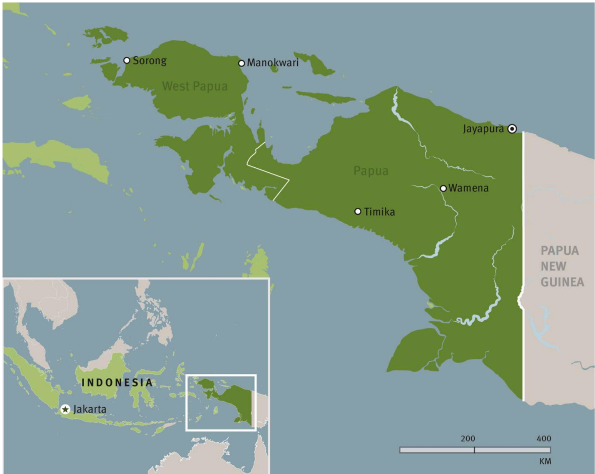
Figure 2. Map of the provinces of Papua and West Papua. Reprinted from Human Rights Watch (HRW), Something to Hide? Indonesia's Restrictions on Media Freedom and Rights Monitoring in Papua , USA, HRW, 2015, pg. ii.