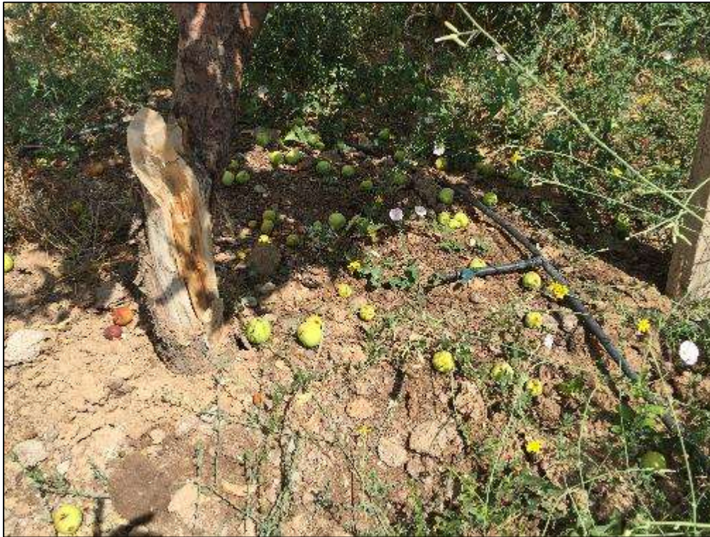
Picture 11. Water being transferred to the plants' roots

Finally, picture 11 shows the location where the water is transferred to the root of the plant.