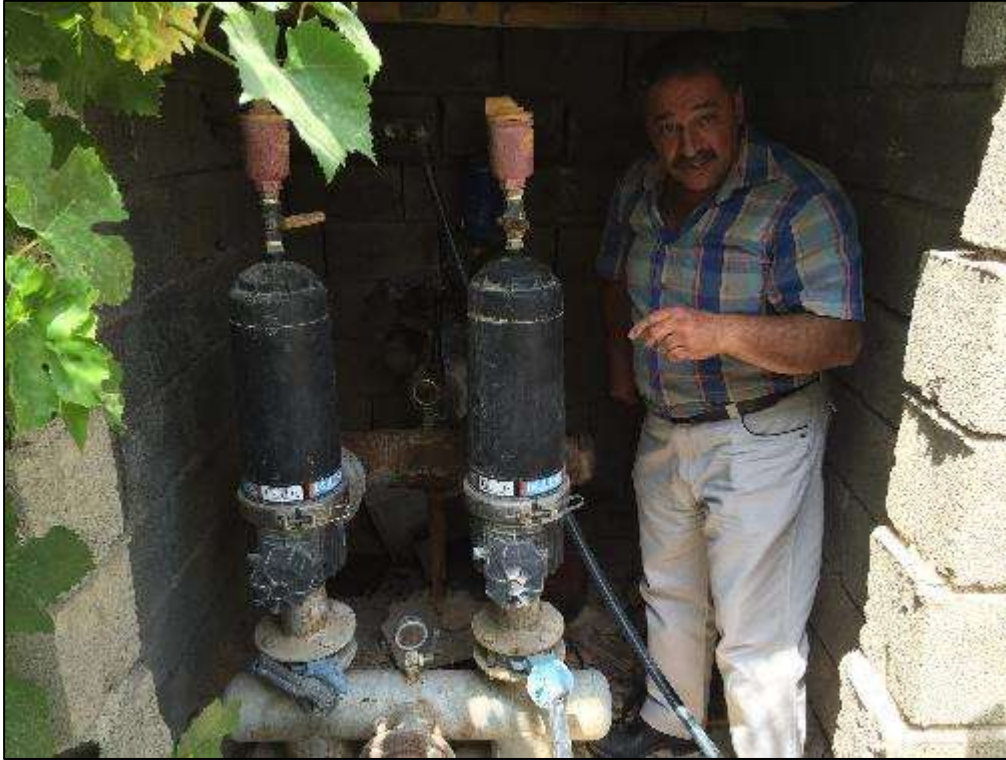
Picture 7. The fertilizer and the chemicals containers

This picture shows a larger well, which belongs to a much bigger agricultural field. The well is on the left, while the field is seen to the right. As it is visible in the picture, the structure is similar to what I had observed at first, water is being pumped out of the well and transferred to the field through tubes.