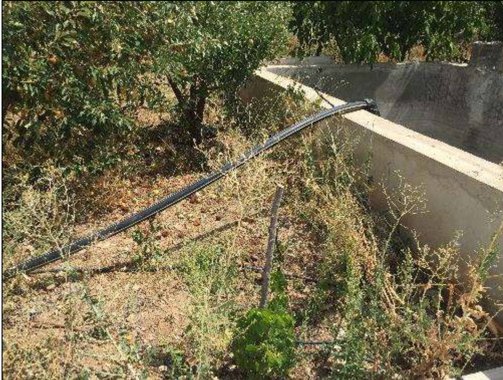
Picture 5. The water tube coming out of the well