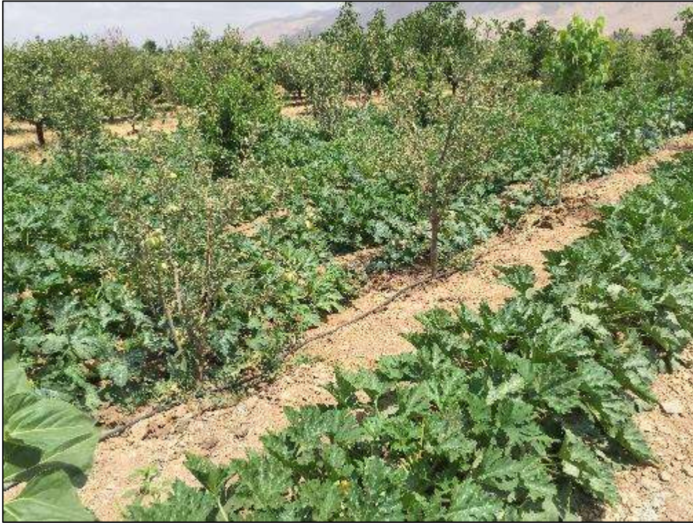
Picture 10. Water tubes on the field

Picture 9 shows the main valve and tube containing the filtered and nourished water, which is ready to be transferred to the plants.