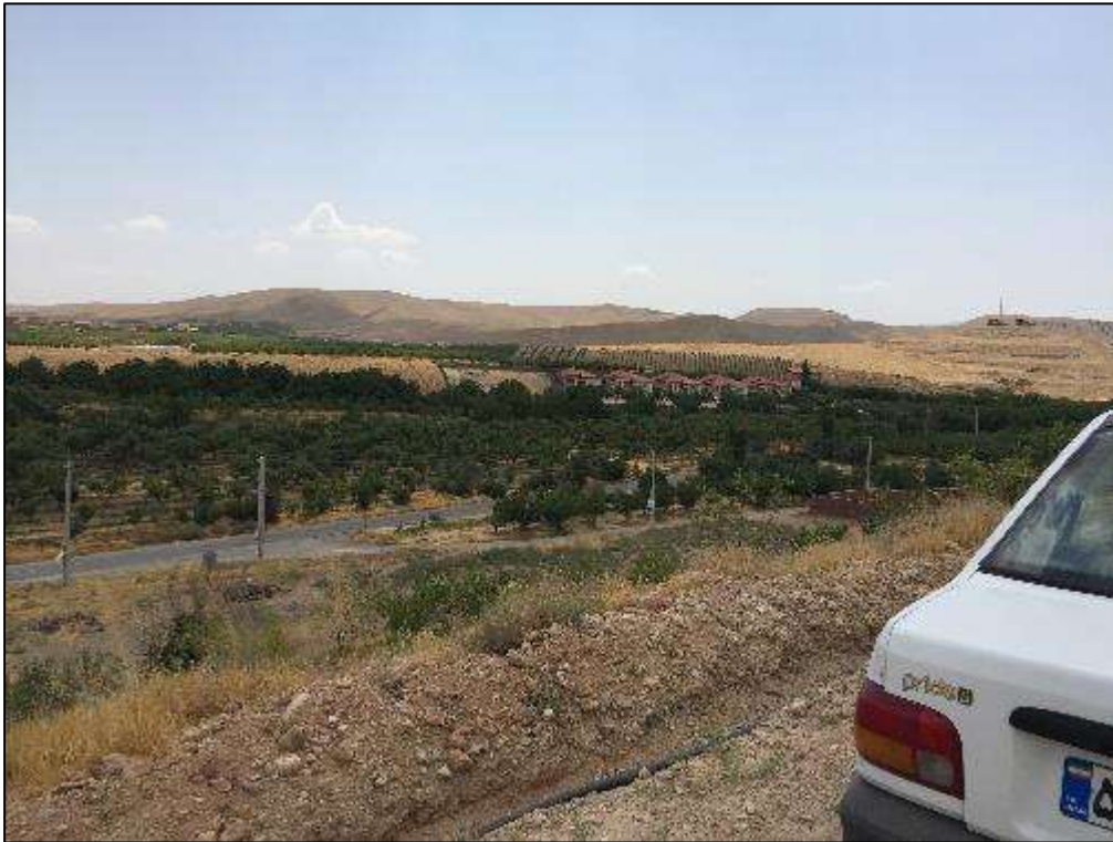
Picture 2. Long shot of the second field

This picture shows the second field, which similarly to the first one shows nothing from the stories around the technology or its relation to the community.