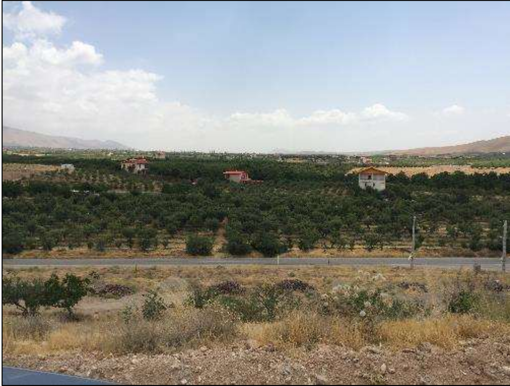
Picture 1. First trial of a wide shot