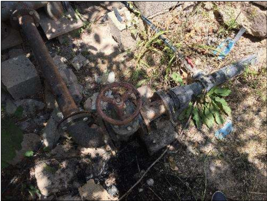
Picture 9. The main valve and tube

Picture 8 shows the filtering device, which filters external elements from the water being transferred to the plants roots.