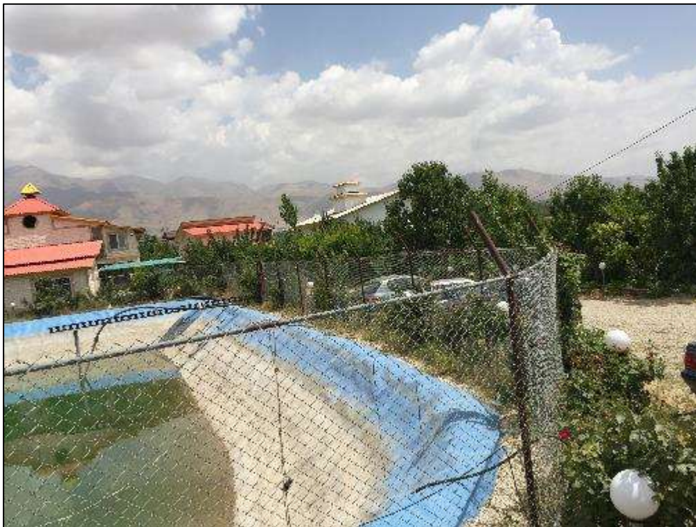
Picture 6. The well of a larger farm