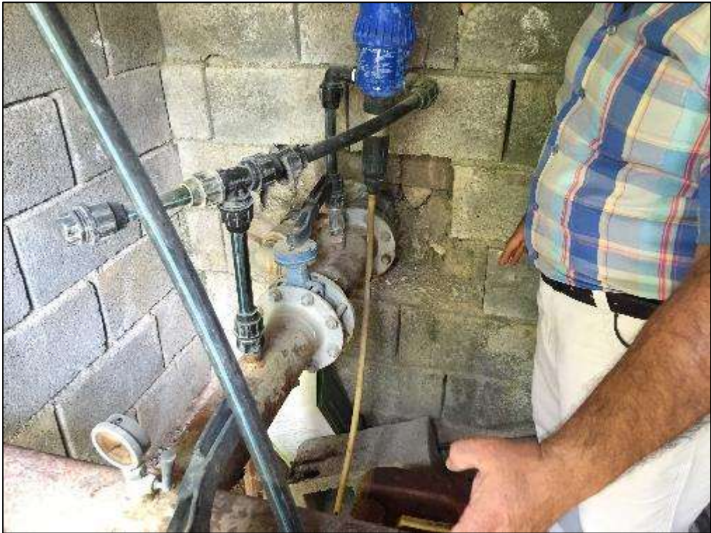
Picture 8. The filtering device

Picture 8 shows the filtering device, which filters external elements from the water being transferred to the plants roots.