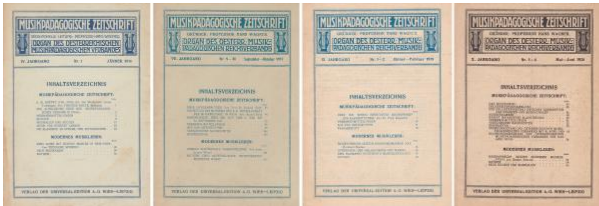
Figure 2: Covers of the Musikpädagogische Zeitschrift

At first glance, the issues of the Musikpädagogische Zeitschrift follow the conventional structure of a music journal, with the additional features of an association newsletter. [20] Integral parts of the journals are essays mainly on music educational topics, which are often printed in installments. The sections already established in the first volume, such as “Verbands-Mitteilungen” (association news), “Bücher und Musikalien” (books and sheet music), and “Notizen” (Notices), were retained. Since the majority of the readership worked in music pedagogical professions, [21] the journal naturally dealt primarily with their everyday work and working conditions. The association fought for a better status for both private and employed music teachers, in terms of their remuneration, their social security, and an upgrading of their training, and was not afraid to name names when pointing out abuses. The sections “Verbands-Mitteilungen” and “Notizen” contain detailed reports of meetings, but also announcements of concerts and other activities of members of the association, in addition to personal information such as professional anniversaries or marriages, reports from the local groups, and job offers. [22] The section “Bücher und Musikalien” presents new publications, with a focus on teaching literature. The end of the editorial section, which is additionally marked with the words “End of editorial section” at the bottom of the page, [23] is followed by a series of advertisements.