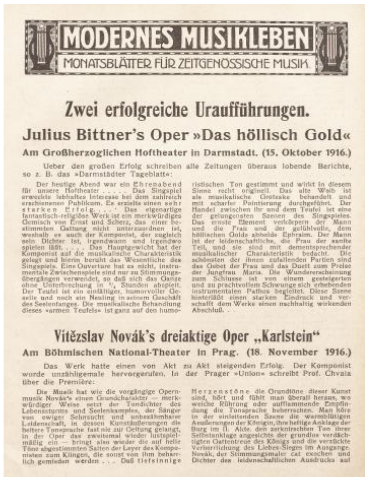
Figure 5: Musikpädagogische Zeitschrift (Modernes Musikleben), 6, no. 11-12 (November-December 1916): 93

Further new publications and concerts could be announced under the vague heading “Notices,” as well as personal news and reports from the composers’ “workshop”: