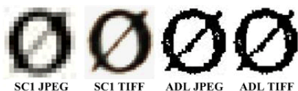
Figure 2. OCR of ø.

Most of the JPEGs have errors in letter recognition. Especially book {a} has many errors in the SC1 JPEG. In many cases the Danish ‘ø’ that is recognised as ‘o’. We chose to study this problem further, an arbitrary ‘ø’ from the SC1 book {a} results, illustrated in Figure 2.