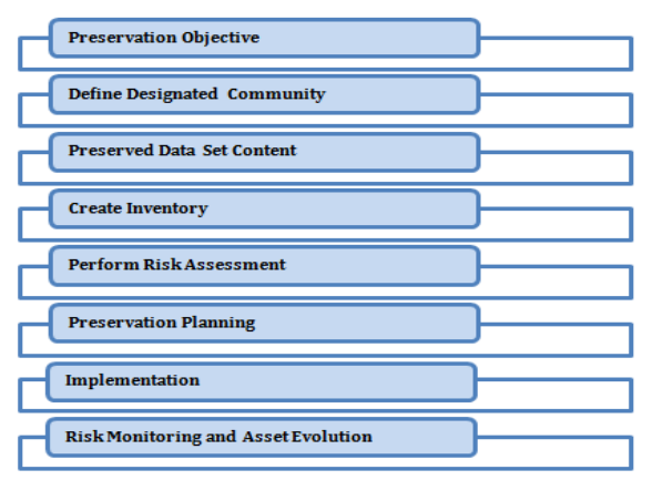
Figure 1. Phases of Preservation Archive Creation

We have defined the following logical model as a guideline to structure the archive definition phase workflow (Figure 1).