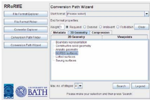
Figure 3: User Interface to RRoRiFE

tests have found it at least as likely for the property to be corrupted or lost as it is to survive. Lastly, ‘fair’ is used in all other cases, alongside an explanatory note.